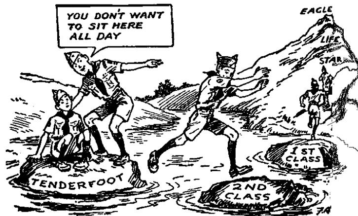
GETTING 'EM OVER